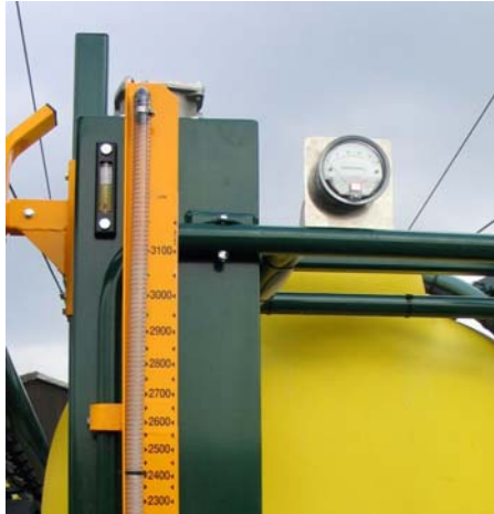
Fig.4: Front side with draw bar, pump, suction filter and front tank contents indicator

cleaning the inside of the tank. The pressurised agitator, which can be switched off, consists of a stainless steel pipe which lies directly above the ground, with a total of 12 injector nozzles. Separate rinsing water tank made of polyethylene for diluting the technical residues,