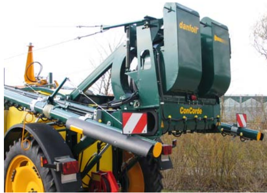
Fig.7: Manually operated control valves

The pendulum suspension has a central pendulum with a pendulum range up to 3° and hydraulic slope compensation up to 5 %. The boom is divided mechanically into 7 segments of which the