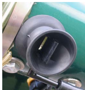
Fig.6: Result table

The liquid flows to the nozzles at low pressure (0.5 to 1.3 bar), is carried by the air and driven to the distribution lip. At the same time, the air which escapes supports the transport of the drops to the target area. The height of the boom can be adjusted hydraulically and infinitely using a lifting frame between 400 and 2050 mm.