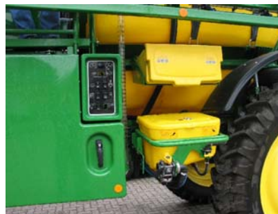
Fig.7: Left sprayer side with control panel and induction hopper

connection with the pump. The liquid is prevented from running back by using a reflux valve. In the main tank there is a pressurised agitator (injector nozzles directly above the floor of the tank) and also a return agitator (two lateral rebound plates). The pressurised agitator can be switched on and off from the driver's seat and also during filling from the left side of the sprayer. The agitator switches itself off automatically when the tank contents fall to the 300 l level in order to reduce the amount of technical residues. In addition it is possible to switch off the agitator manually or at a specified tank level automatically. The most important functions for filling and agitating are centralised at the operator controls on the left of the sprayer. The tank can also be emptied here via an electric valve. The draining hole is protected from external impact by a metal cap.