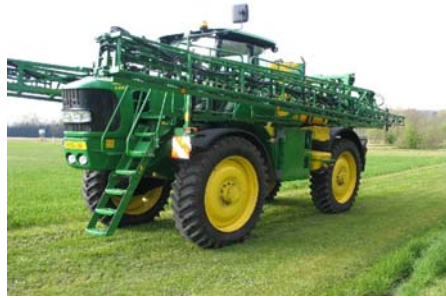
Fig.4: Left sprayer side with lateral folded boom and ascent to the drivers cabin.

The John Deere 5430i has an all-wheel-drive and pneumatic spring mounted axles. The tread of the chassis can be adjusted hydraulically between 1.9 and 2.6 m. The adjustment is made whilst moving at a low speed. It is driven by a 175 kW diesel engine with a hydrostatic 40 km/h gearbox. The operator can vary the speed infinitely using the throttle and one of the four speed settings. The undercarriage is covered entirely with a steel plate to provide a smooth surface which is kind to plants. The equipment has been designed as a built-on sprayer for the John Deere 5430i and is connected to the carrier vehicle at four support points. The built-on sprayer is removed by lifting it from the carrier vehicle. External hoisting gear is required to do this.