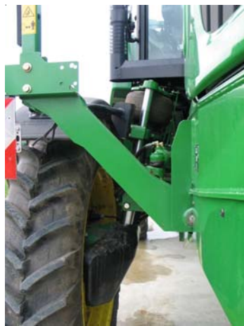
Fig.5: Wheel suspension.

This equipment has been designed as a built-on sprayer for the John Deere 5430i and is connected to the carrier vehicle at four support points. The sprayer is secured with screws.