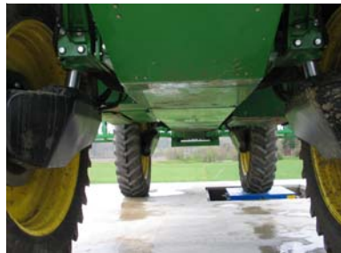
Fig.6: Smooth covered under side. In the front you see the front axle.

The tank which is made of polyethylene has no splash walls. The special shape of the tank sump is designed to avoid large quantities