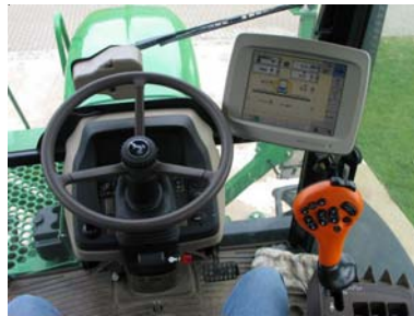
Fig.8: drivers place with „Greenstar 2“.

It is controlled either via the valves in the cab or if preferred via the operation controls on the left of the sprayer (filling, cleaning, emptying). The operation controls include switches for the following functions: engine speed selection, agitator on/off, container rinsing