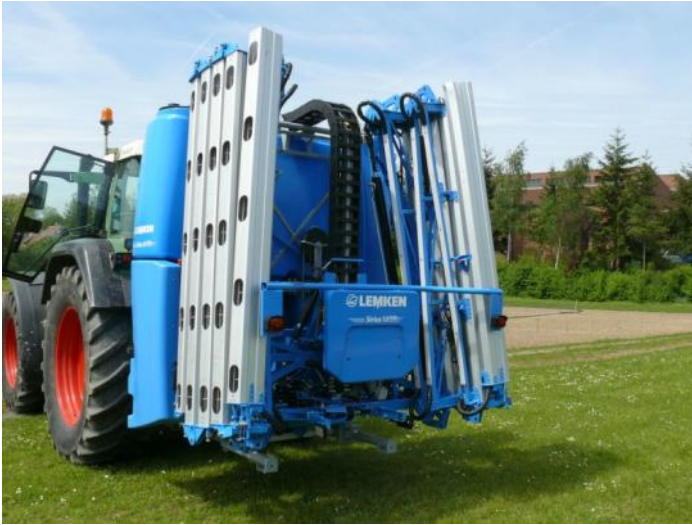
Fig.4: Left sprayer side with folded boom.

The base frame is made of angular steel panels and profiles. It is attached to the tractor using a patented quick coupling element. A special feature of the quick coupling element is that the p.t.o. drive shaft, the upper link and the hydraulic connections can be connected to the tractor before the equipment itself is positioned directly behind the tractor to then be attached. This means that it is no longer necessary to negotiate the small amount of