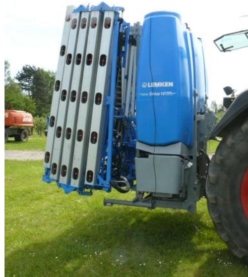
Fig.7: Sprayer with folded boom and quick coupling frame.

The tank has a nominal volume of 1900 l and is made of polyethylene. The volume in the tank is measured by an electronic level indicator (TankPilot) with a display to the left of the framework and also at the Ecospray terminal. The tank can be filled either by a filling connection with a KAM-LOCK coupling on the left, a hydrant filling connection with a reflux valve or a suction injector. The clean water tank is made of polyethylene with a volume of 196 l (underneath the main tank on the right) for diluting the remaining technical fluid, and for cleaning the inside and outside of the tank and rinsing equipment parts which transport fluid.