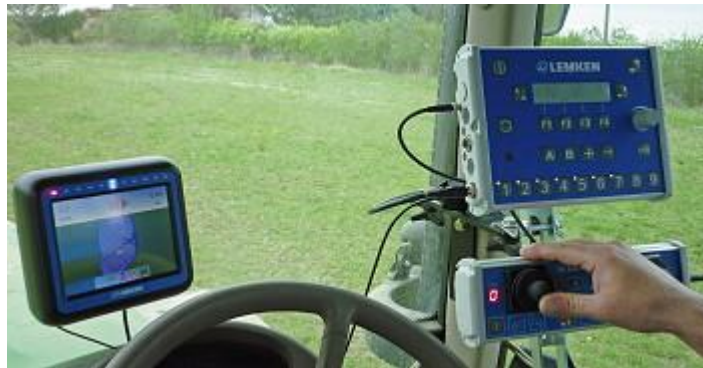
Fig.10: Control terminal LEMKEN Ecospray and EcoControl in the drivers cabin.

control in automatic mode at any time so that individual boom sections can also be folded separately. Up to nine sections can be controlled. When in operation, the terminal shows the application rate (l/ha), pressure (bar), driving speed, level of fluid in the tank and relative boom height (%). Moreover, there is an integrated angle display for adjustment to slope inclination. Function menus also contain information on the remaining area, entire area and flow rate.