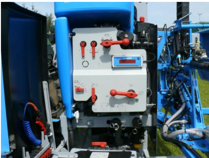
Fig.8: Left sprayer side with control centre, hand wash tank (left of control panel).

The sprayer is equipped with a power agitation system and a standard agitation system for mixing the plant protection product and distributing it evenly into the spray fluid. The power agitation system is built by an agitating rod with a total of 11 injector nozzles (Lechler mixing nozzle 4 mm) at the bottom of the tank for agitating products which have left deposits. The standard agitation system comprises two injector nozzles (1 x left side, 1 x right side). The system's output can be adjusted indefinitely using a valve. Both agitation systems can be switched off.