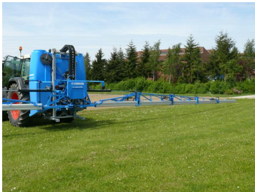
Fig.6: Unfolded boom and boom lift.

The lateral boom extensions can be angled separately and hydraulically. The boom has 5 segments on each side and one middle part. The boom suspension comprises a pendulum frame with an incline-adjustment feature. The boom halves are separated in the middle of the boom and are damped horizontally by rubber stops.