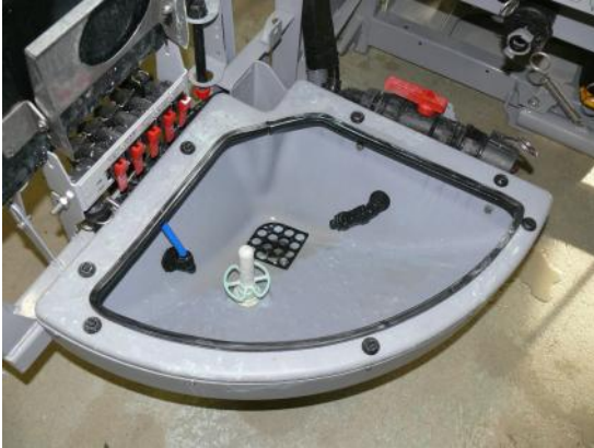
Fig.9: Induction bowl underneath the control panel.

The control valves comprise electromagnetically controlled individual nozzle valves, pressure regulation valve, flow meter (ARAG DN 25), pressure sensor on the nozzle tube and the terminal, LEMKEN Ecospray. The sprayer is controlled entirely at the terminal; in addition the hydraulics can be operated either by Ecospray or if preferred by EcoControl. The boom is folded in automatic mode by EcoControl; first of all it is lifted and then folded section for section via sensors. The driver can take