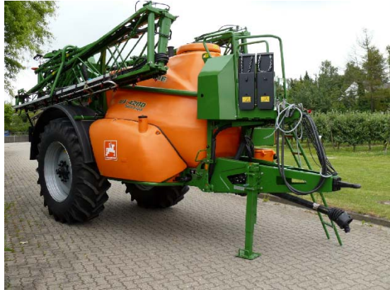
Fig.4: Right sprayer side with lateral folded boom.

The chassis is a framework construction made of steel profiles with the pump placed between the two drawbar profiles. The track width of the sprayer is 1.8 m. The chassis is designed for a maximum speed of 40 km/h.