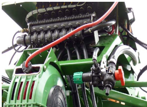
Fig.7: Block with section valves and pressure adjustment device of the recirculation system „DUS“ (big tube at the right side).

the spray. Also the fluid conducting parts of the boom can be rinsed independently. The circulation system works with a fixed liquid pressure in the pipes but it can also be completely switched off. Thanks to this (overpressure) recirculation system the amount of non delutable residual can be reduced to about 1.5 l. By using the tank filling connection the tank can easily be filled with the pump. The spray level reading is possible manually (at the left sprayer side) or on the display. Both level indicators fulfill the accuracy requirements entirely.