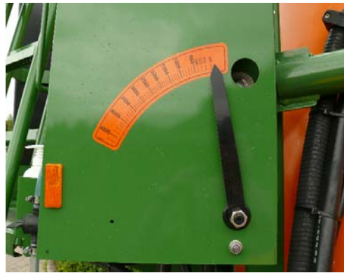
Fig.6: Contents indicator for filling.

liquid system. The separate hand wash tank holds 22.5 l. The pressurised agitation system can be switched off to keep the