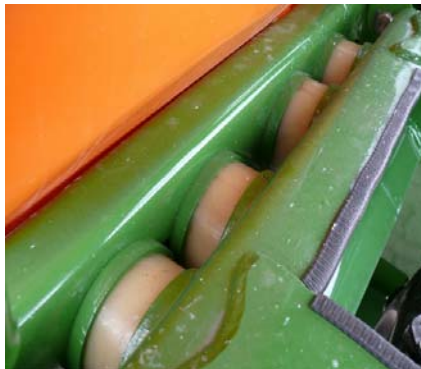
Fig.5: Drawbar dampers.

The spray tank is not designed with splash walls and only a small part of its base is flat due to its slim shape and sloping sides. This