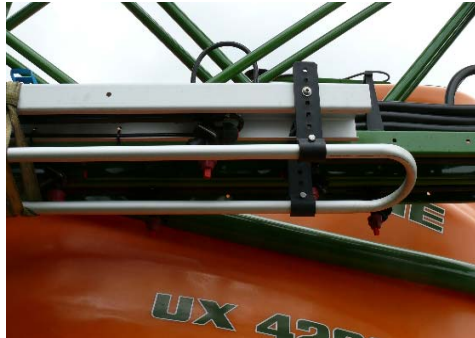
Fig.8: Nozzle protection bar at the outer boom segments.

The boom is a framework construction made of steel profiles whose height can be adjusted hydraulically and infinitely by a parallelogram. It comprises a central pendulum with a pendulum range of up to 10^\circ and hydraulic incline adjustment up to an incline of 15 %.