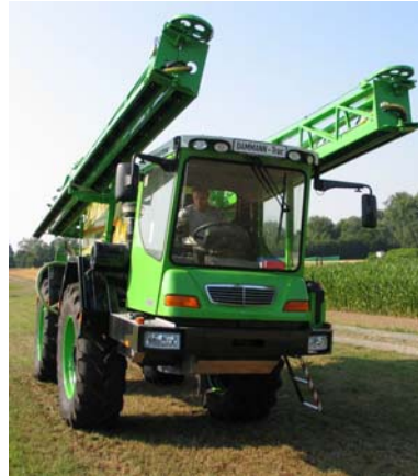
Fig.4: Right sprayer side with lateral folded boom and ascent to the drivers cabin.

The equipment has been designed as a built-on-sprayer for the DAMMANN-TRAC DT500 and is connected to the carrier vehicle at four support points. The DAMMANN-TRAC has an all-wheel-drive, as well as all wheel compressed-air brakes and all wheel suspension by coil springs. The vehicle can be ordered with track width between 1.8 m – 2.0 m. It is driven by a 170 KW diesel engine with 40 km/h gearbox. The gears can be shifted automatically or by shift