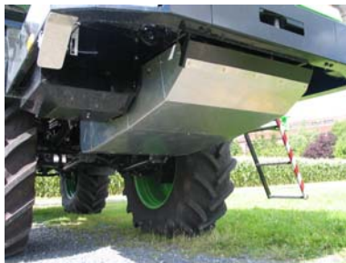
Fig.5: Aluminium plates for smooth surface.

rocker. The hydraulic functions are activated manually or automatically by the spray computer „Basic Terminal TOP“. The vehicle is equipped with a trailer hitch so trailers up to 16 t with compressed-air brakes can be towed. For better manoeuvring the driver is supported by two cameras (in the front below the cabin and in the back). In the front section the undercarriage is covered with aluminium plates to provide a smooth surface which is kind to plants.