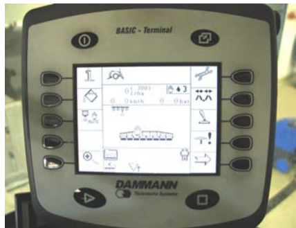
Fig.7 and 8: Drivers place and „Basic - Terminal“.