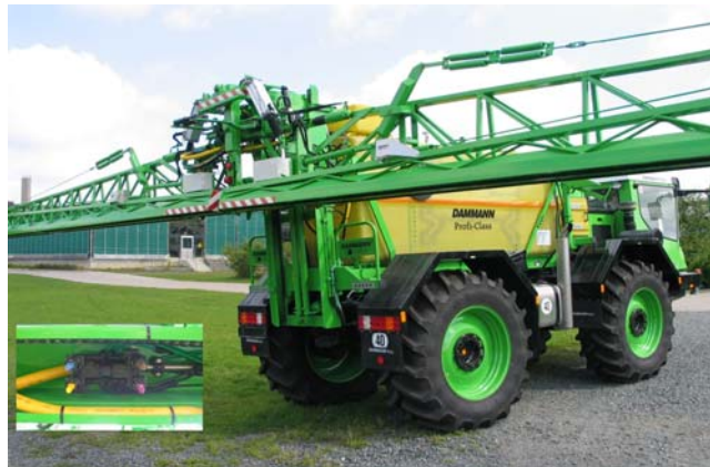
Fig. 6: Spray boom and Lechler „Varioselekt“.

The tank which is made of fiberglass is equipped with three splash walls and an integrated rinsing water tank and two separate pressure agitation systems. One works as heavy duty agitation system for reagitation after brakes. The other one as agitation system during spraying. In the tested version the agitator switches itself off automatically when the tank contents fall to the 300 l level in order to reduce the amount of technical residues (value is adjustable via the terminal). As preparation for overwintering all liquid lines include the pump can be flushed with compressed air so after cleaning the lines no liquid will remain in the liquid pressure circuit. The most important functions for filling are centralised at the operator controls center on the left of the sprayer. The induction bowl with the container rinsing nozzle and circular pipe can be lowered when in use. The contents of the spray tank can be seen online at the „Tank-Control“ whilst filling. The boom is a framework construction made of steel and aluminium profiles whose height can be adjusted hydraulically and infinitely variable. It comprises a central pendulum with a pendulum range of up to 15 ° and hydraulic incline adjustment up to an incline of 30 %.