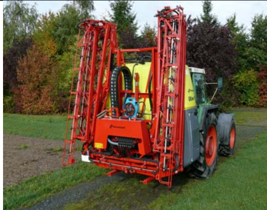
Fig.4: Sprayer rear view with folded boom.

Chassis and boom are framework constructions made of steel profiles. The connection is realized by a quick coupling frame. That is how the sprayers centre of gravity can be close to the tractor and concurrent the PTO