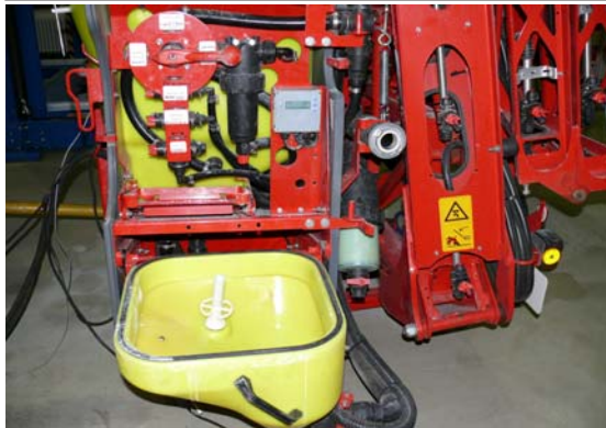
Fig.7: Left sprayer side with control centre and retracted induction bowl.

For loading the plant protection product, a retractable induction bowl can be used. This bowl is equipped with a circular pipe for flushing the plant protection product into the tank and for rinsing the