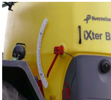
Fig.5: Contents indicator.

and hydraulic connectors are easily accessible. For parking the sprayer extendible rests are existing.